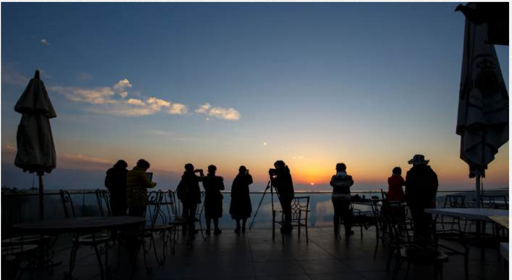
Sunrise from Bar Terrace