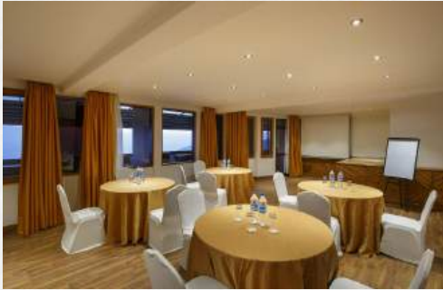
Nagarkot Hall in Cluster Set up