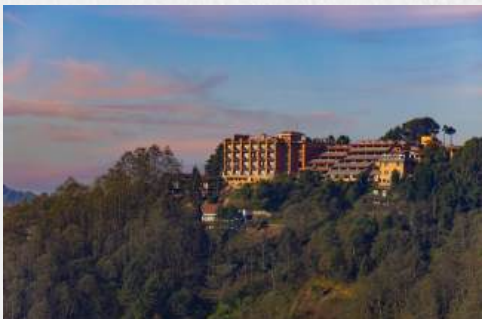
Club Himalaya Exterior