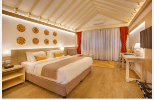
Deluxe Premium Room