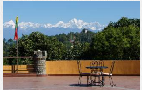
Mountain View from Phulchoki Terrace