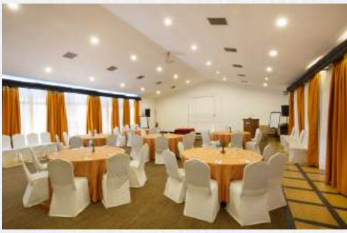
Bhaktapur Hall in Cluster Set up