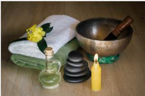
Himalayan Healers SPA