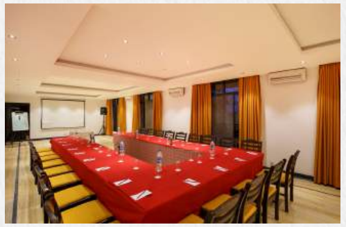
Lalitpur Hall in U Shape