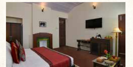
Accommodation 6 rooms across 2 categories - Classic and Imperial. The Classic rooms offer panoramic views of the mountains.