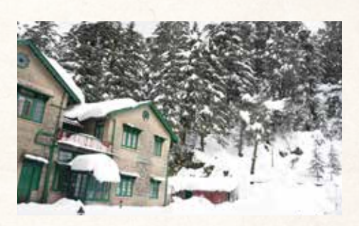
Winter Wonderland During the winter, Brij Villa transforms into a story-book vista with snow-capped, trees, peaks and roofs!