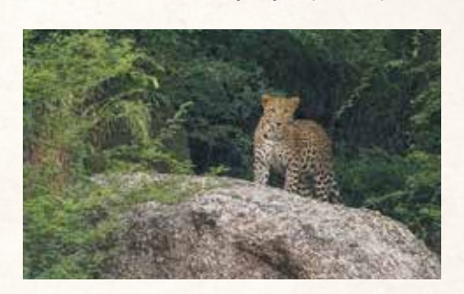
Wildlife The Jawai Bandh is known for leopards, crocs and more! Our experienced naturalists bring their immense knowledge to your experience.