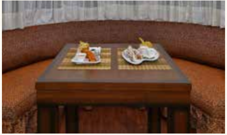
Dining An on-site multi-cuisine indoor-outdoor restaurant called Cedar serves freshly prepared Indian and world cuisine.