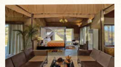
Accommodation 4 apartment sized, luxury tents with sky- lit bathrooms, and spacious common areas. Two tents with private plunge pools.